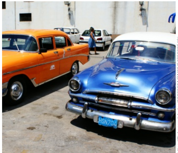
Tire

https://flickr.com/photos/55066951@N05/5425062549/