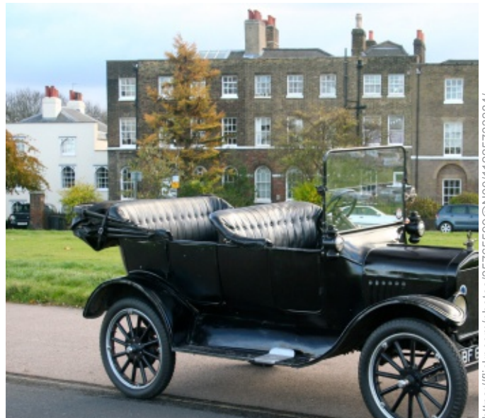
Geneva Motor Show 2011

https://flickr.com/photos/357656599@N00/11225733384/